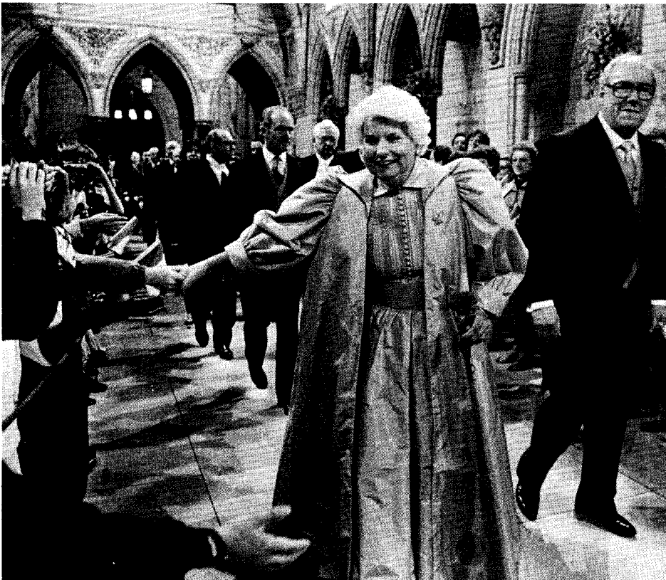
The Governor General and Mr. Sauvé leaving Parliament following the investiture ceremony.

Prior to serving as Speaker she had held three different ministerial portfolios: Minister of State for Science and Technology, Minister of the Environment and Minister of Communications.