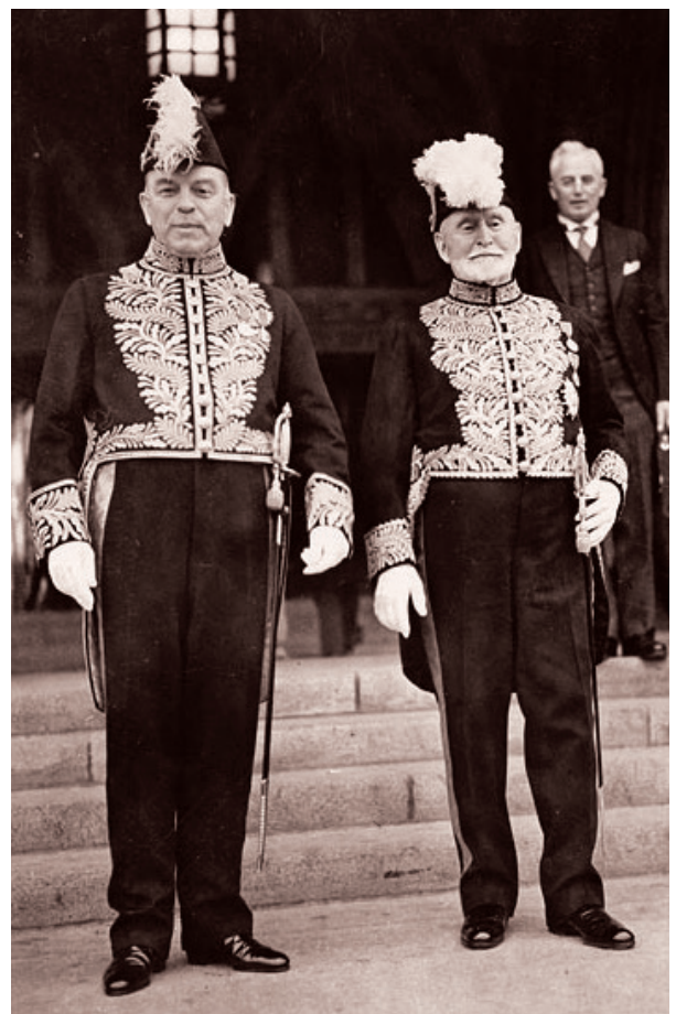
Prime Minister William Lyon Mackenzie King and Senator Raoul Dandurand

with some adding that he influenced their decision to not attend party caucuses. It was not surprising then that when a group of senators later formed an independent block to rebel against party discipline in the Senate in 1980, they adopted the moniker “Dandurand Group.” 2 Though his name has gradually faded in the Senate, his legacy remains especially relevant today at a critical juncture in the institution’s history. As the Senate debates ways to change its procedures and practices to reflect the increasing number of independent senators, it is worth remembering that today’s suggestions regarding Senate “modernization” echo in many ways Senator Dandurand’s vision of an independent, non-partisan chamber from nearly a century ago.