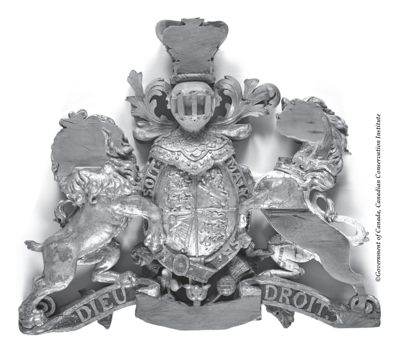
The Montreal Parliament's coat of arms, once restored by the Canadian Conservation Institute. The abuse suffered by this item during the 1849 riot can be clearly seen.