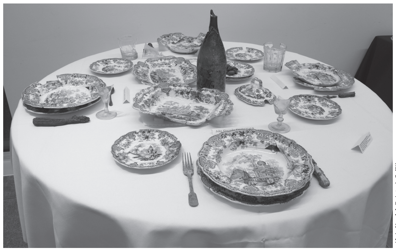
The British tableware from the Parliament restaurant.

The 2017 excavations were among the largest ever undertaken in Montreal in recent years, and possibly in most North American cities. Excavations reached a depth of 5 meters below the modern surface. Many levels were excavated mechanically, but the main occupation levels, including the Parliament's, were carefully excavated manually, using trowels and brushes.