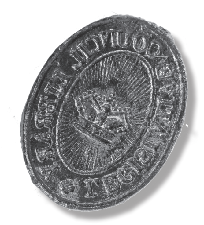
The "Legislative Council Library" handstamp.

Until its discovery, this first official handstamp in use after the union of Upper and Lower Canada was only known from antique manuscript documents that bore the stamp in blue, red, or green ink. The handstamp we found among the burned ruins is the only known specimen.