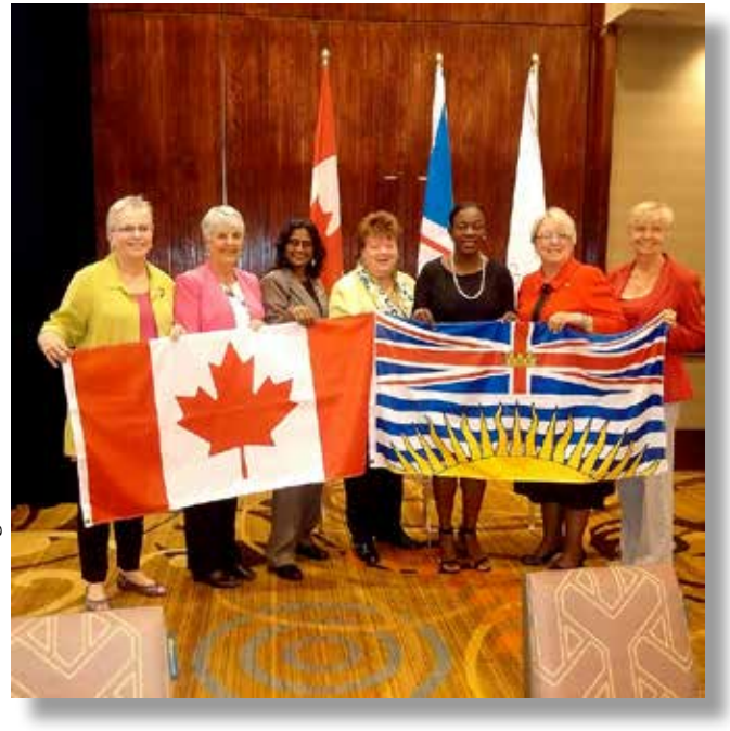
BC delegates to the CWP meeting pose with guests from the Caribbean delegations.