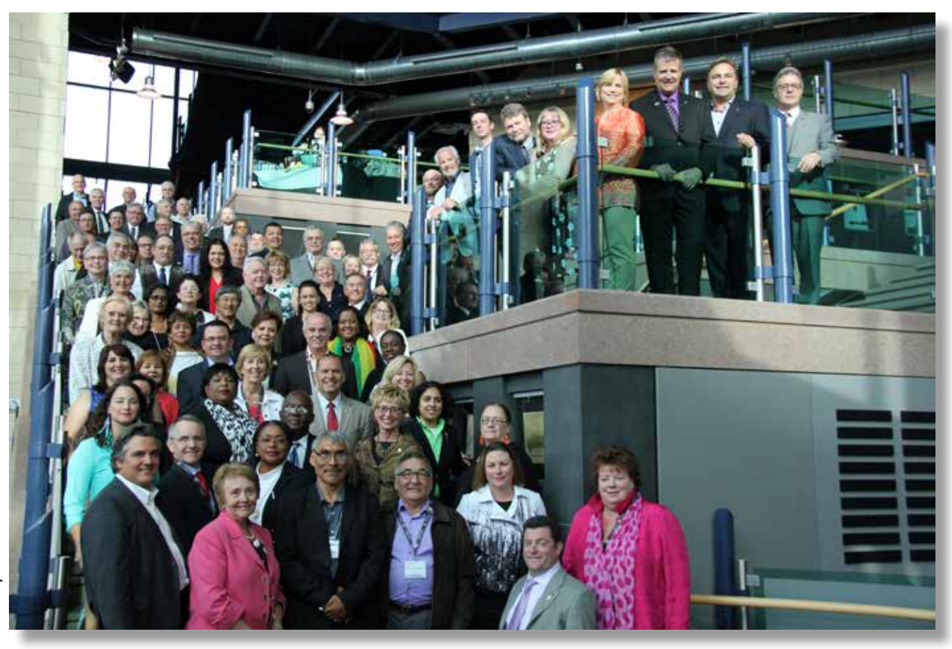
The official conference photo for the 54th CPA – Canadian Regional Conference in St. John's, Newfoundland and Labrador.

Newfoundland and Labrador where the legislature is attached to the government building. On the issue of order/decorum, Speaker Osborne revealed that when he was a newly elected member in the Assembly there was a sort of initiation where a dedicated minister heckled him as a new member. In recent years, after witnessing the behavior present during some debates, teachers who have brought school groups for tours of the Assembly have stated they do not plan to return in the future because it was such a poor example for young, impressionable people. Upon becoming Speaker, he established decorum, provided training and delivered instructions to parliamentarians where consequences for misbehavior were clearly spelled out. He touted a significant improvement in the number of points of order - there were 15 points of order over 39 days whereas previous session had more than 200 points of order in the same number of days, and one day had over 40. Community stakeholders have also noticed improvements, he added.