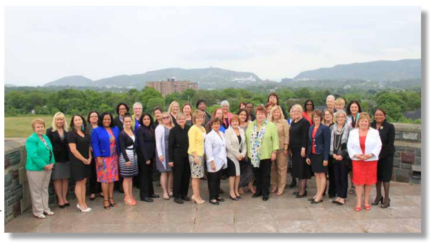
CWP Canada delegates pose outside the Newfoundland and Labrador House of Assembly building overlooking St. John's harbour.

Gender-responsive budgeting has the possibility of influencing number of women parliamentarians. During the discussion period MP Yasmin Ratansi stressed that changing the mindset in the bureaucracy is also important as they implement and offer policy that gets funded.