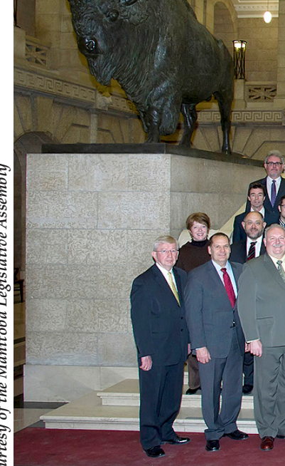
Delegates of the 32<sup>nd</sup> Annual Presiding Officers' Conference pose at the entrance of the Manitoba Legislative Assembly.