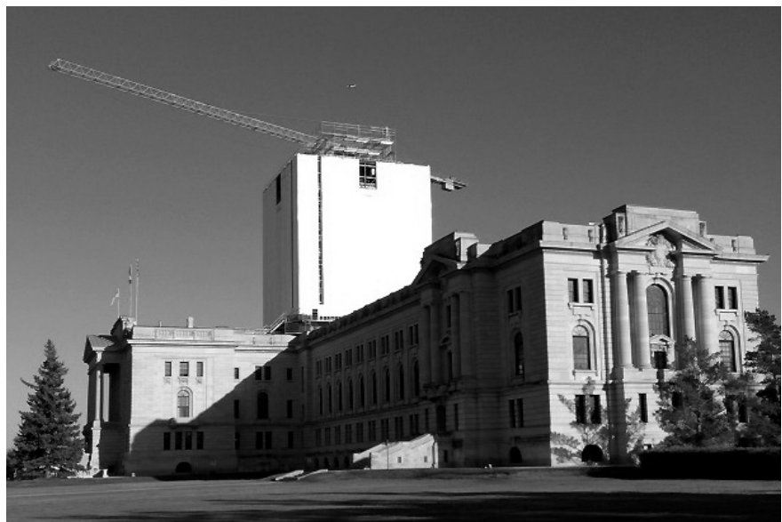
The dome at the Saskatchewan Legislative Building is undergoing significant renovations.

On October 8, the very active Select Committee Regarding the Risks and Benefits of Hydraulic Fracturing (RBHF) issued a news