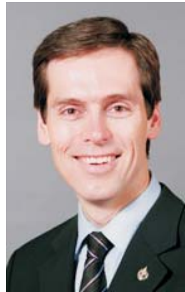
Russ Hiebert, MP

The new Chair is Russ Hiebert who represents South Surrey-White Rock-Cloverdale in the House of Commons. Originally from Steinbach, Manitoba, he first studied Engineering at the University of