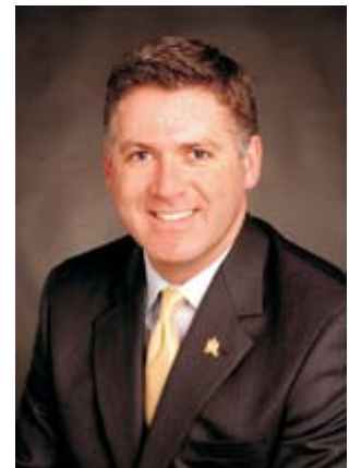
Hon. Cecil Clarke

A former federal PC candidate in 1997 for Sydney Victoria; he was first elected to the House of Assembly in March 2001, and re-elected in 2003. He served in the Cabinet as Minister of Energy, Minister of Economic Development, Minister responsible for the supervision and management of the Nova Scotia Business Incorporated Act and Minister Responsible for the Innovation Corporation Act ; the NS Film Development Corporation; the Water Development Corporation and the World Trade and Convention Cen-