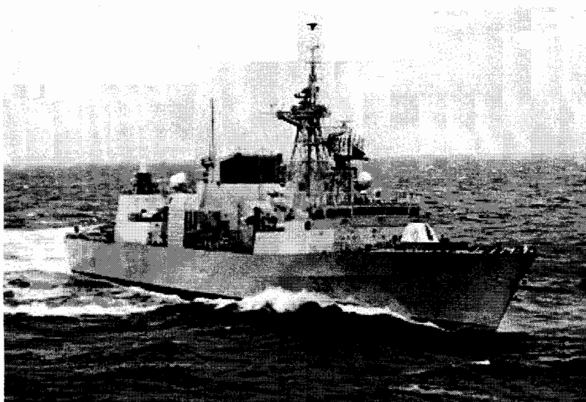
The highlight of the social programme was a day sail on the HMCS Vancouver a fully operational warship stationed at Esquimaux