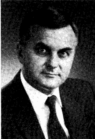
Ramon Hnatyshyn (Andrews-Newton)

In January Ramon Hnatyshyn was installed as the new Governor General of Canada replacing Jeanne Sauvé whose term had expired.