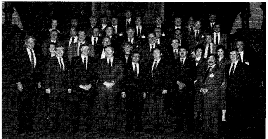
Speakers, Deputy Speakers and observers at the Presiding Officers Conference

The annual meeting of the Canadian Regional Council of CPA will coincide with the end of the seminar.