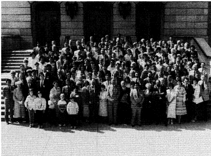
Delegates and observers at the 27th Regional Conference

The conference took place while the legislature was in session. This complicated the task of the organizing committee but did not prevent the conference from being a tremendous success.